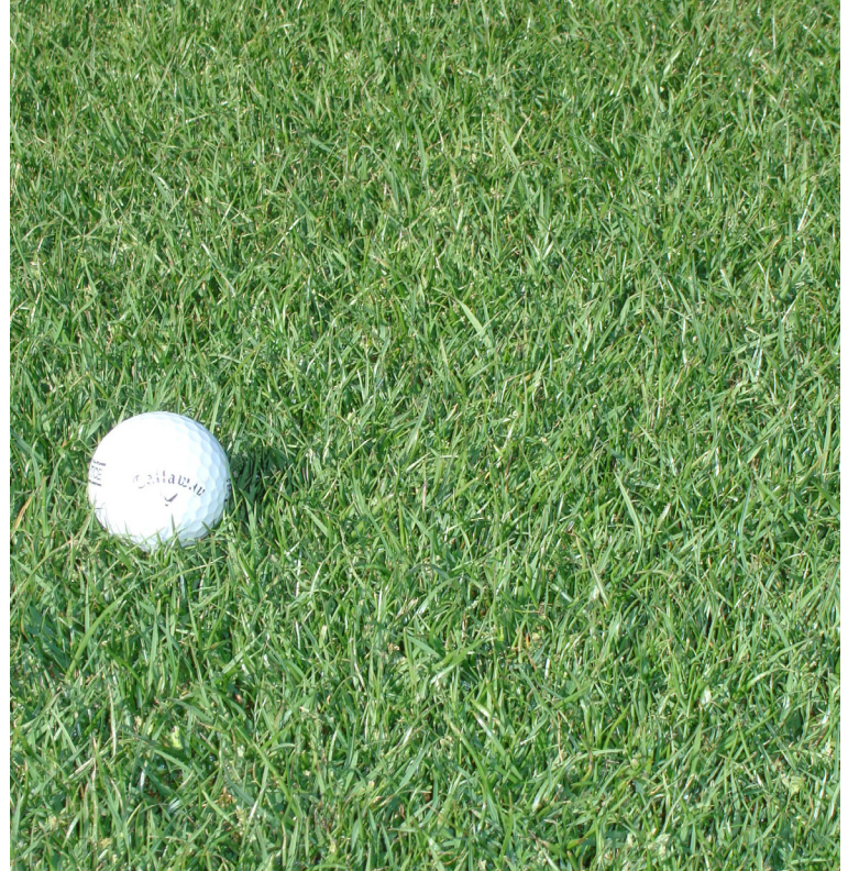
BREAKOUT with STT is ideal for golf applications. It's fine leaf texture and density match that of warm season bases much better than other turfgrass varieties. These traits combined with smooth, predictable transition allow for use on tees and fairways.