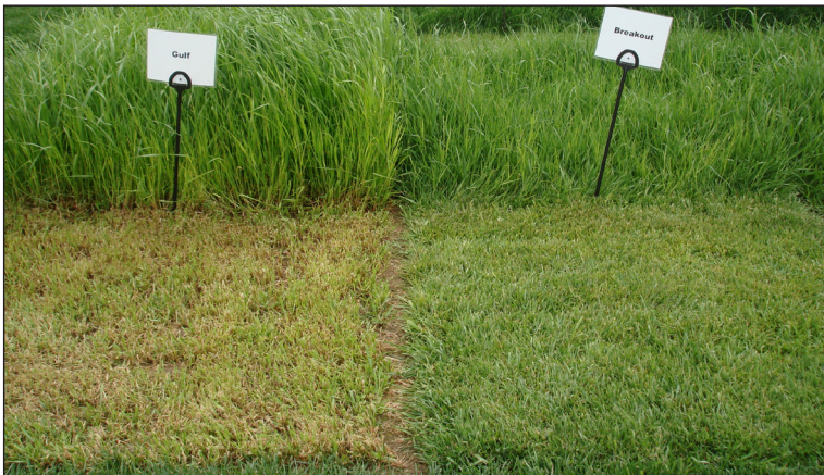
BREAKOUT with STT (right) exhibits a much darker green color and also a much finer blade texture and better density than Gulf (left).

The University of Arizona trials (charts at right) also showed how much better the color and texture BREAKOUT with STT exhibits compared to other commonly used varieties.